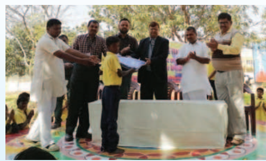
School Bag to Student