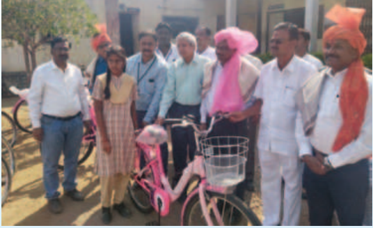
Lady bicycles to students