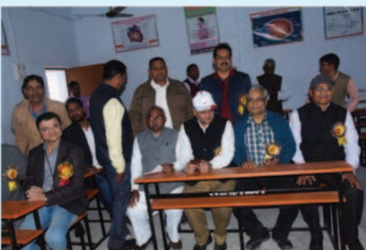
Desk-bench to school