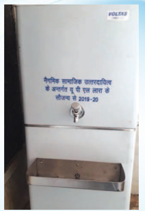
Water cooler to school