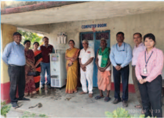
Almirah & Chairs to School