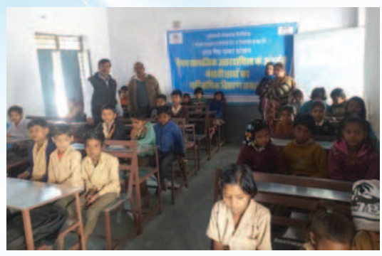
Desk-bench to school