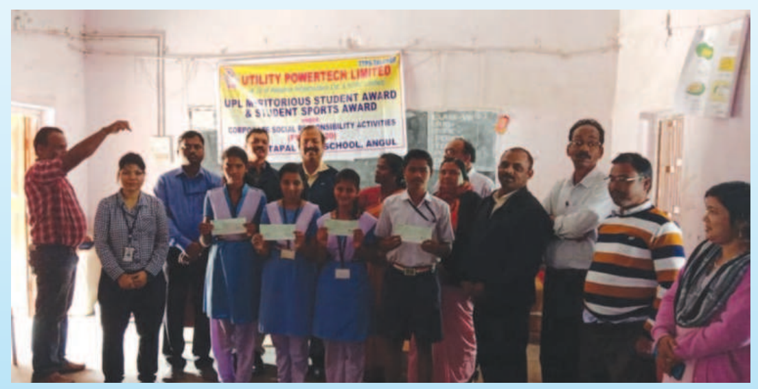
UPL Meritorious Student Award