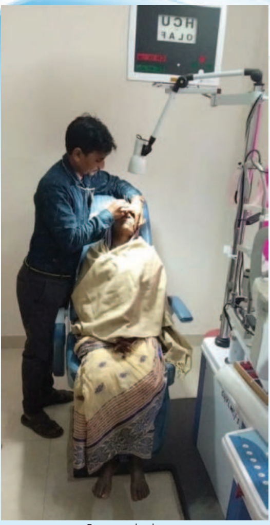
Free eye check-up