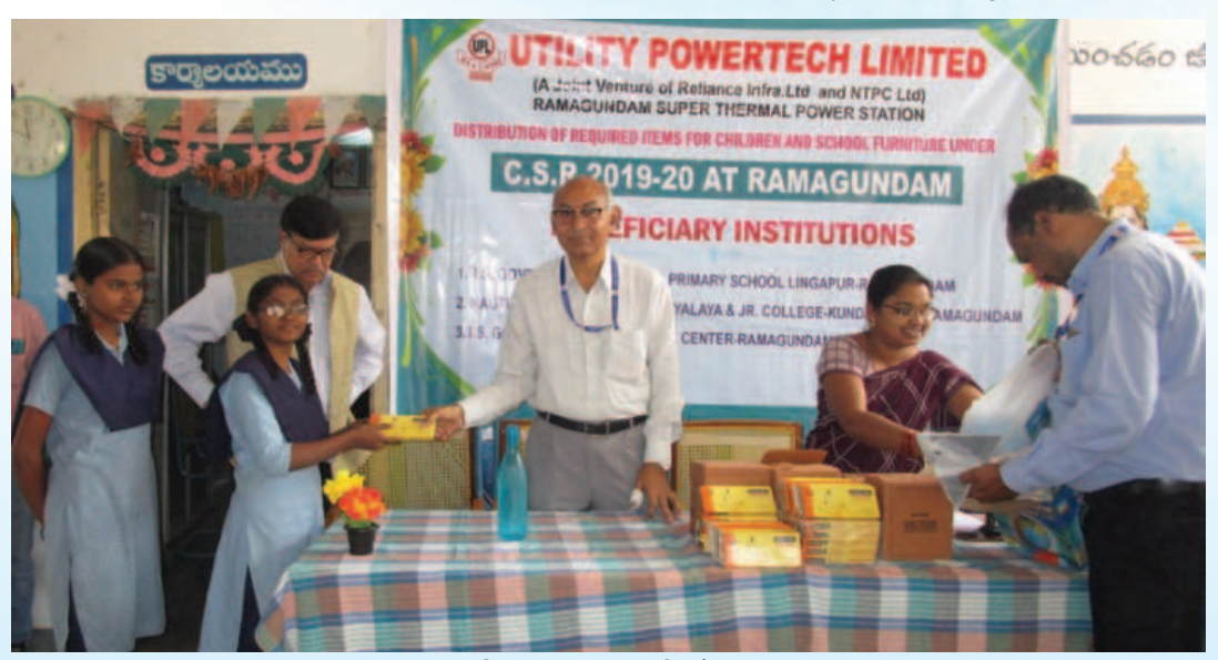
Geometry Box to Student