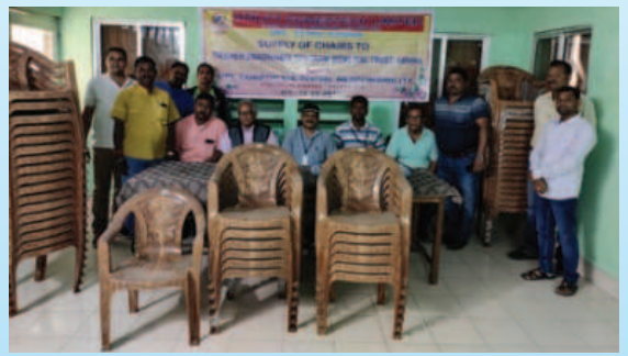
Chairs to Swadhinta Sangram Trust