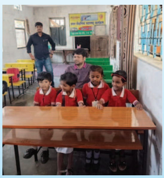
Desk-bench to school