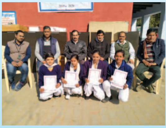
UPL Meritorious Student Award