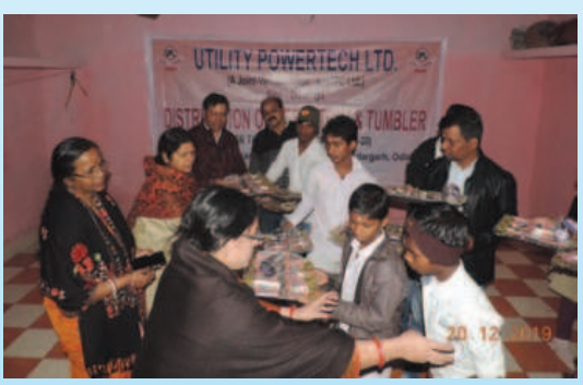
Thali & glass to student of an orphanage