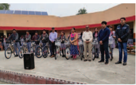
Lady bicycles to Students