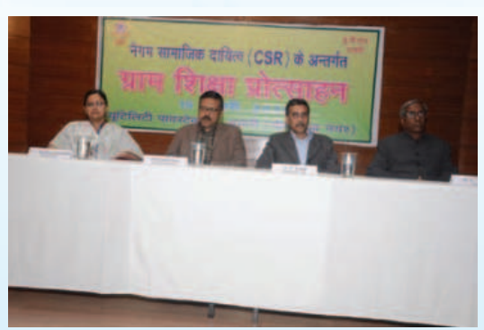
UPL Meritorious Student Award