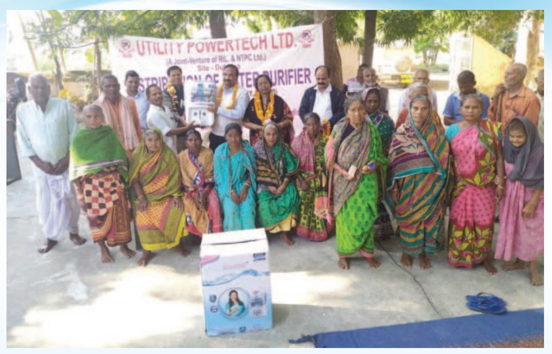
Water purifier to old age home