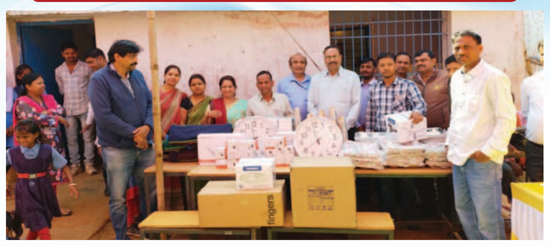
Steel thali, glass, CCTV, fans, wall clock to school