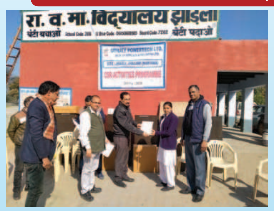
Blackboard, chairs, computer to school