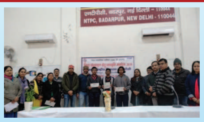
UPL Meritorious Student Award