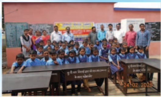
Desk-bench to School