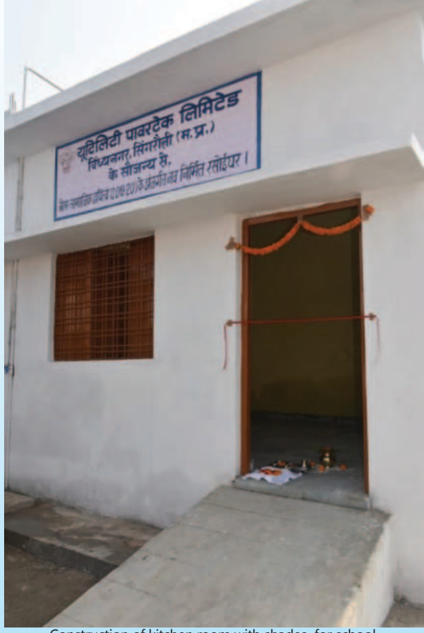
Construction of kitchen room with shades for school