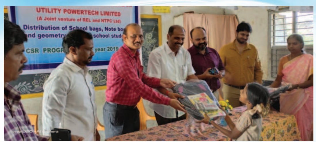
Note book & geometry box to student