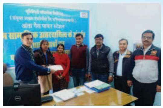
UPL Meritorious Student Award