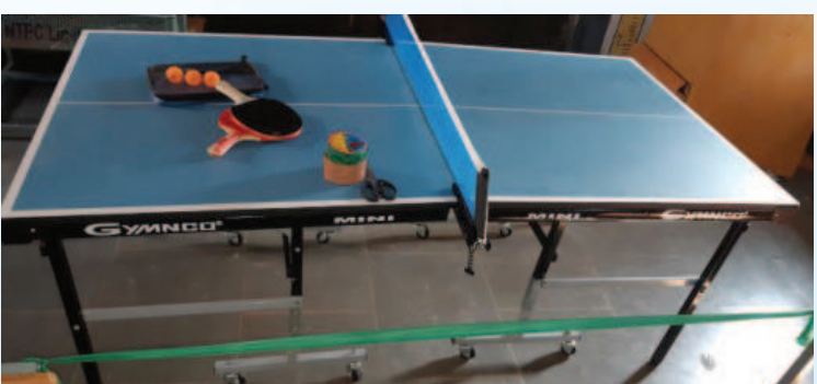
Sport Item to School