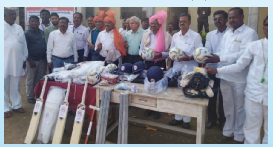
Sport items to school