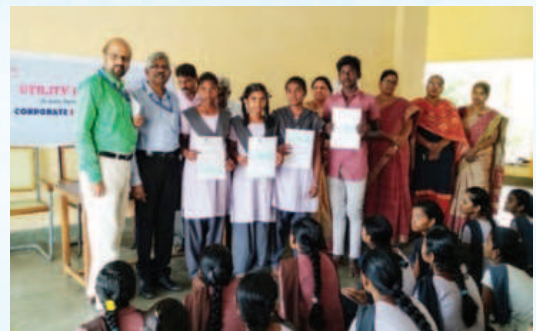
UPL Meritorious Student Award