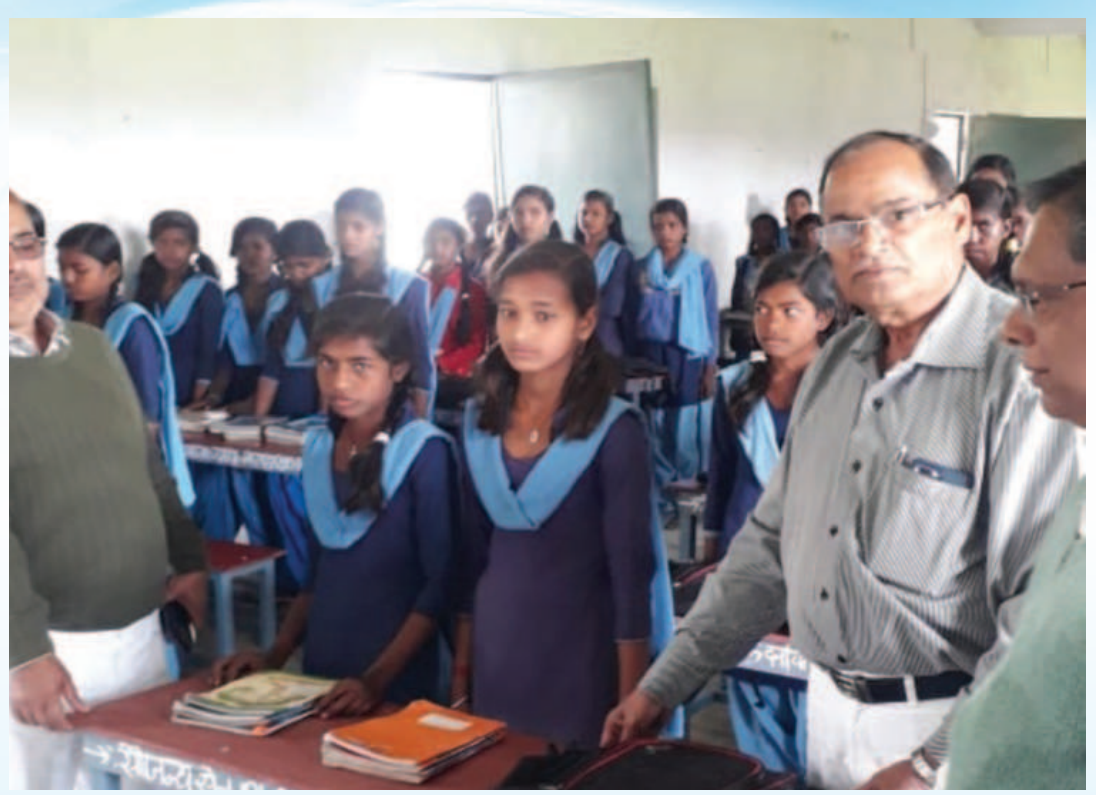
Desk-bench to school