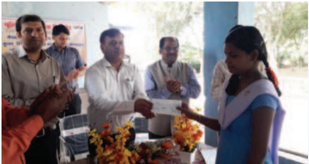
UPL Meritorious Student Award