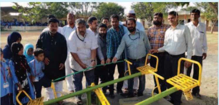
Iron Ups and Down Flank to School