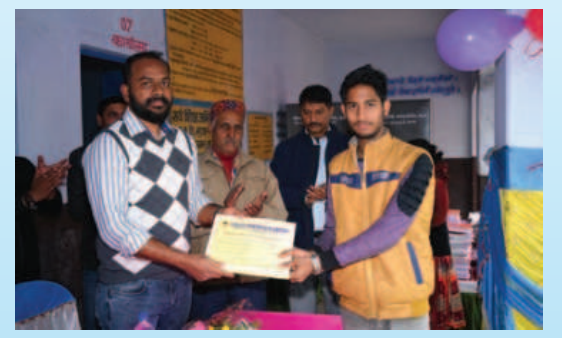
UPL Meritorious Student Award