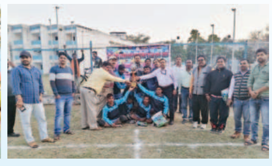
Gramin Kabaddi Prtiyogita