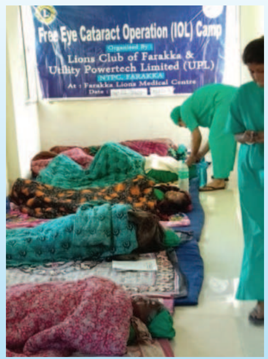
Free eye operation