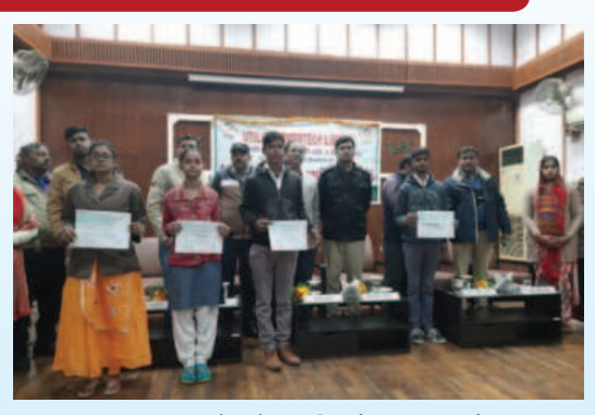
UPL Meritorious Student Award