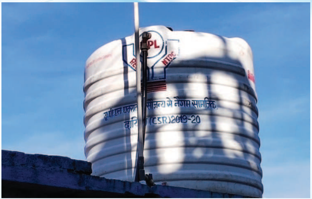
Water Tank to School