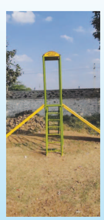
Iron Sliding to School