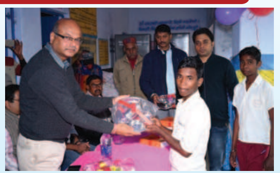
Thali-Glass for Mid Day Meal