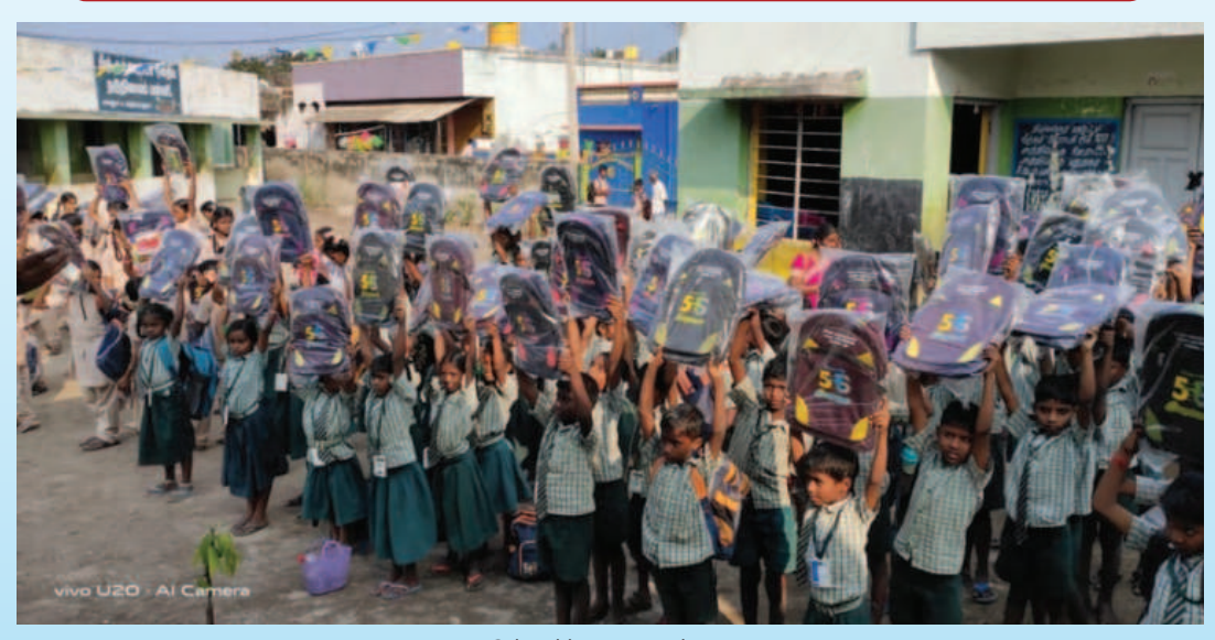
School bag to students