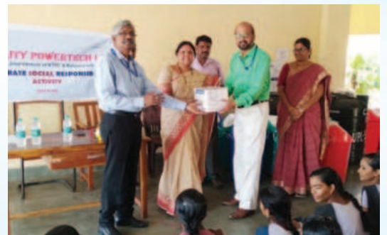
Fans to school