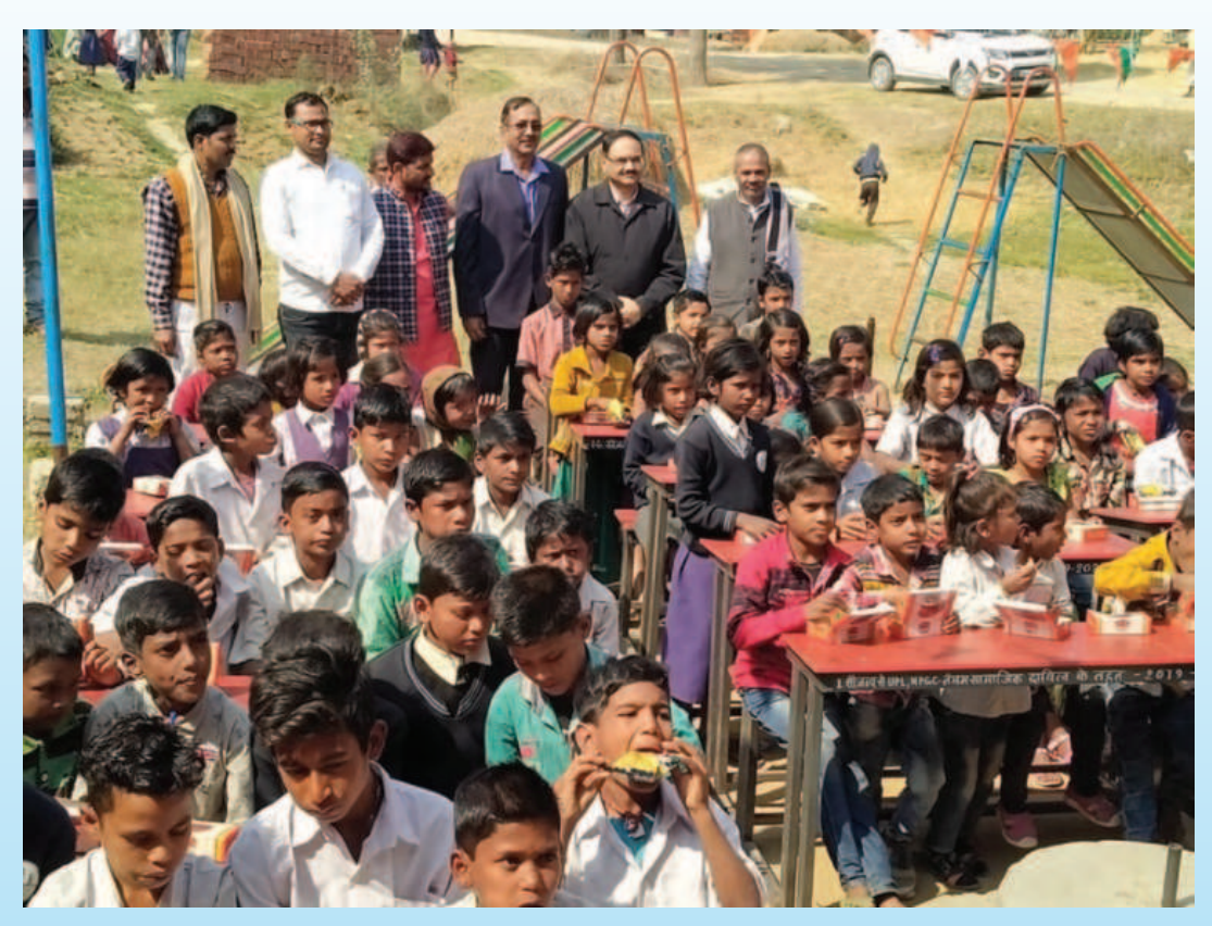
Desk-bench to school