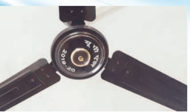
Fan to school