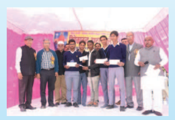
UPL Meritorious Student Award