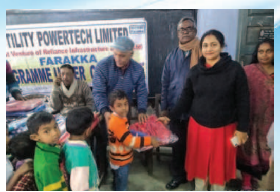
School Bag & Umbrella to Student