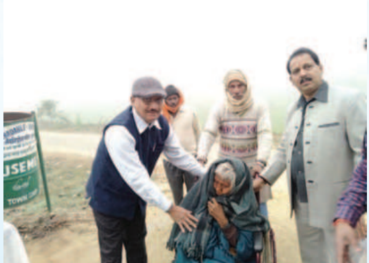
Blanket to destitute persons