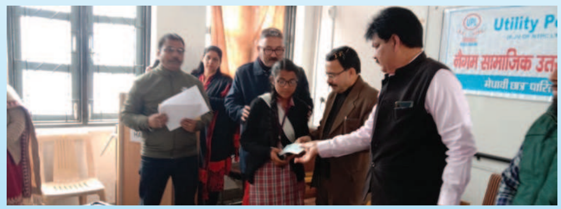
UPL Meritorious Student Award