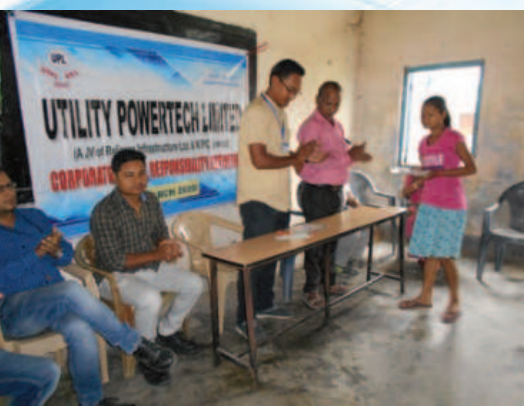
UPL Meritorious Student Award