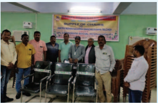
Chairs to Pabitra Mohan Nagrika Manch