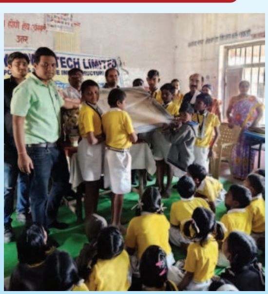
Sport item to school