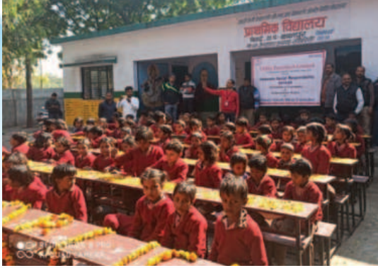
Water Bottle to Students