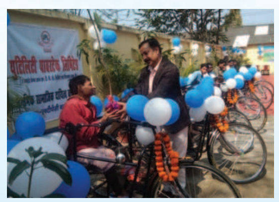
Distribution of Tri-Cycles