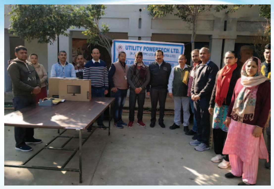
Computer to School