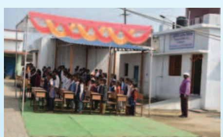
Desk-bench to school