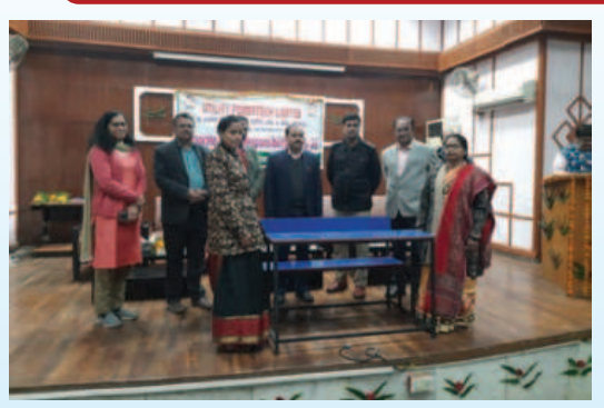
Desk-bench to school