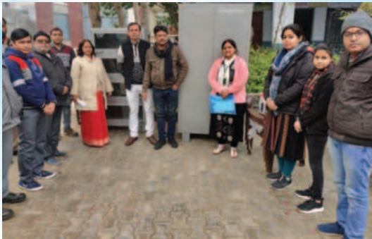
Almirah, bookshelf to school