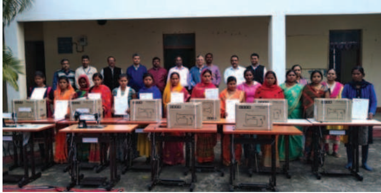
Paddle Swing Machines to Trained Women