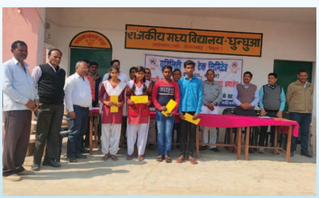
UPL Meritorious Student Award