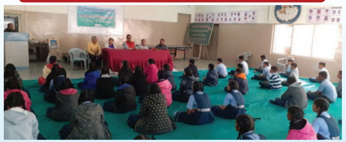
UPL Meritorious Student Award